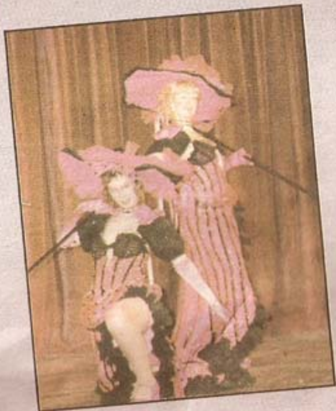
STYLISH DUO: Two of the dancers