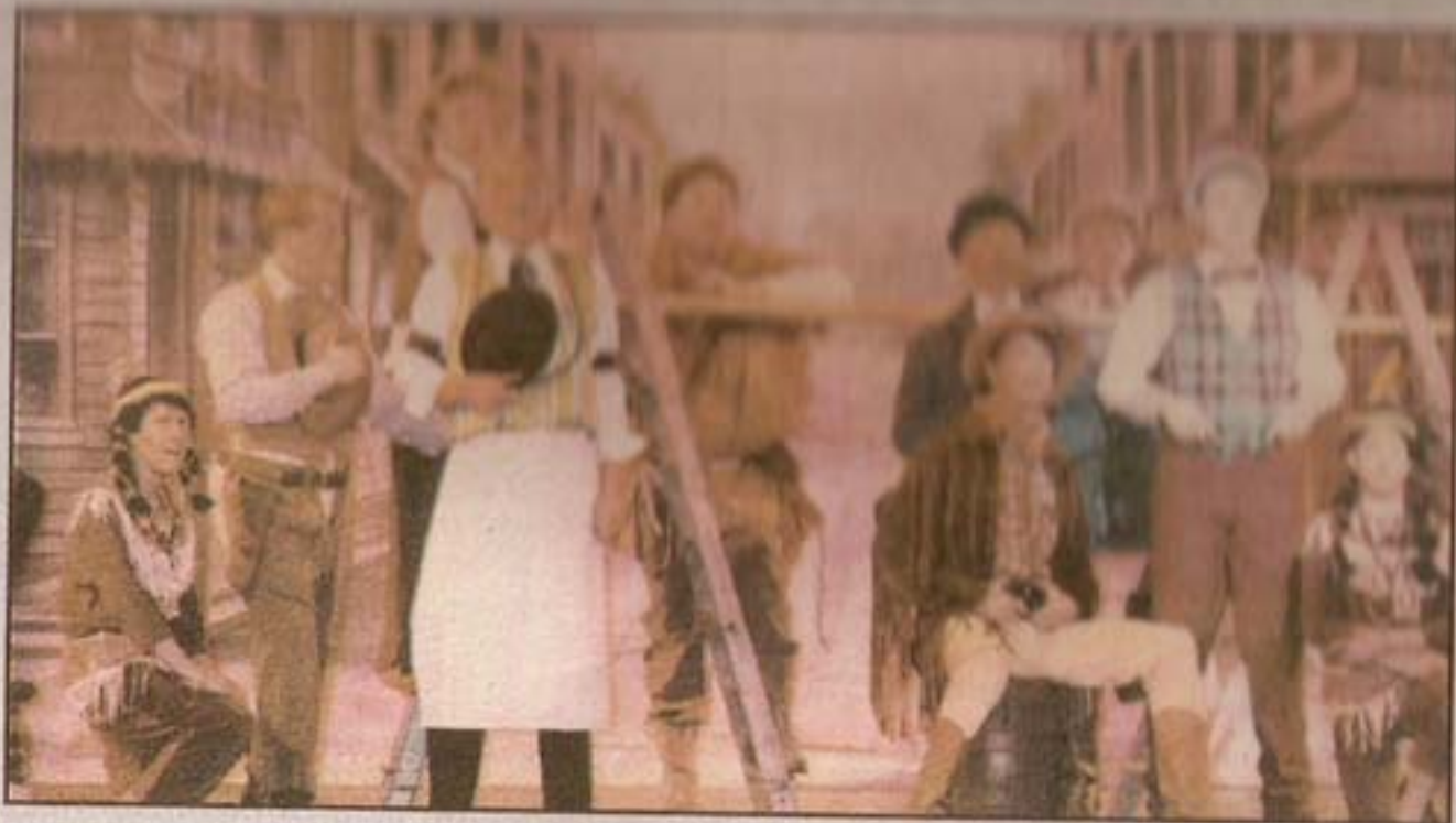
GREAT OUTDOORS: A scene from the streets of Deadwood