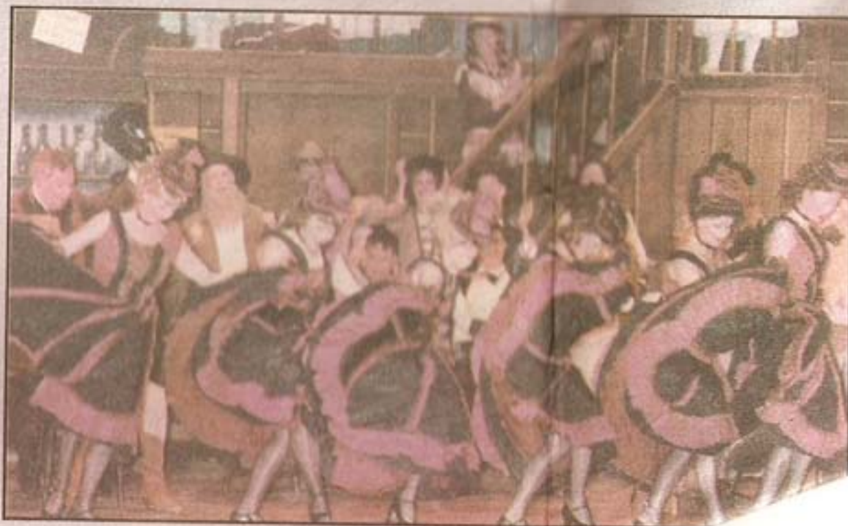
SHOWING A LEG: The can-can in furious flight in the saloon